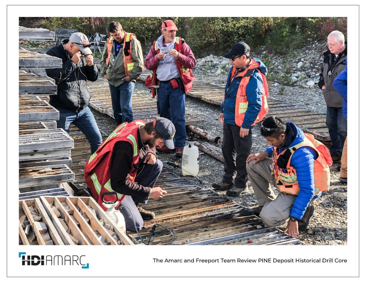
Figure 1 The Amarc and Freeport Team Review PINE Deposit Historical Drill Core

United States Securities and Exchange Commission at www.sec.gov and its home jurisdiction filings that are available at www.sedar.com.